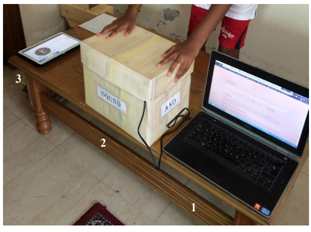
Figure 3. Experimental Setup. 1: Laptop (application to create sound). 2: Test box (contains speaker and covered with the test materials). 3: iPad (sound meter).

The distance between the decibel meter and the test box was 30 cm; this distance was maintained for every test. A battery-powered speaker was turned on to the maximum volume. Numerous sound frequencies (ranging from 200 to 1500 Hz) were tested, and the volume of it was kept exactly the same throughout the experiment. Different sound frequencies were tested in order to find the sound penetration among the different frequencies. The speaker was then connected to a laptop using a stereo jack ( Figure 3 ). The speaker was placed in a test box covered with the test materials (bubble wrap, foam, Styrofoam, gypsum and jute). The Online Tone Generator software [14] from a laptop was used to play a constant sound. A Sound Meter app [15] was used