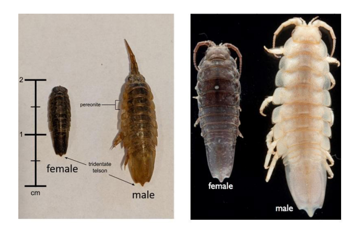
Figure 1: Comparison of deceased Massachusetts Idotea balthica (on left) and Baltic Sea individuals (on right). The Massachusetts specimens shown were the largest of the group under observation. Note that the male's antennae are dried together, and the female's antennae are not visible. The picture of the Baltic Sea specimens is taken from Leidenberger et al. (1).

The results of the anatomical comparison showed that the Massachusetts specimens exhibited predominantly similar characteristics to known examples of I. balthica (Table 1 and Figure 1). When compared with other candidate species, the Massachusetts specimens' features aligned most closely with I. balthica (Table 1). The Baltic Sea and Massachusetts females were both observed to be dark brown in color (1). Not counting antennae length, the Massachusetts isopods had maximum lengths of 21.2 mm out of three males measured and 10.0 mm out of three females measured, while I. balthica measured up to 21.9 mm for males and 14.8 mm for females (1). Despite the difference observed between Massachusetts and Baltic Sea females, I. balthica was still the closest match in length out of the six candidate species. The other species were all significantly shorter or longer than the Massachusetts isopods (1, 6, 7, 8). In perhaps the clearest identifying characteristic, the Massachusetts specimens displayed the