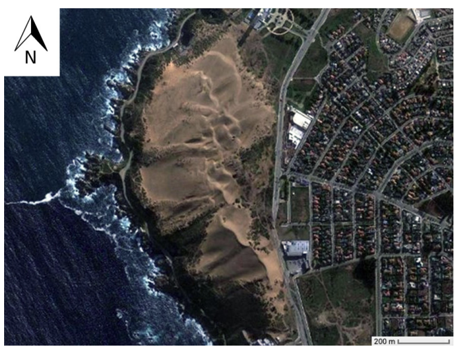
Figure 1: Sand dune from Concon. Coordinates 32°54'30" and 32°58'50" south latitude and 71°30'40" and 71°34'46" west longitude. Nearby cities: Viña del Mar

To test our hypothesis, we determined the composition of 20 seed islands and how many seeds germinated in each one. We concluded that seeds account for only 30% of the total content of seed islands, and the majority consists of branches and rabbit feces. Despite this, on average, four seeds germinated in each seed island. This outcome supports our hypothesis (Figure 2B).