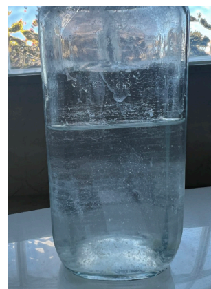
Figure 3: S. major and D. magna growth after hydrogen peroxide ( \text{H}_2\text{O}_2 ) treatment. Forty-eight hours after the introduction of hydrogen peroxide, S. major cells were bleached with no chlorophyll visible and D. magna sunk to the bottom of the jar and experienced 100% mortality (n = 4).

The goal of this work was to observe the effects that various commonly used algaecides have on S. major and a non-target organism, D. magna . Although algaecides are known to eradicate unwanted algae populations, many effects that the chemicals have on neighboring species are unknown. In the six-jar setup, the jars contained the following contents: Jar 1 contained S. major and no algaecide; Jar 2 contained S. major , D. magna + food, and no algaecide; Jar 3 contained D. magna + food, and no algaecide; Jar 4 contained S. major , D. magna + food, and \text{CuSO}_4 as the algaecide; Jar 5 contained