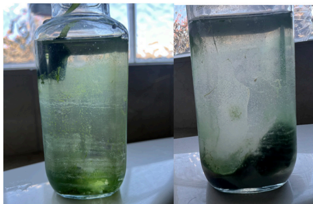
Figure 1: Growth of S. major and D. magna with no algaecide treatment. Images show immediately after mixing cultures in the jar (left) and after 48 hours (right). S. major and D. magna thriving.

Microscopy images were taken to view the effects of the