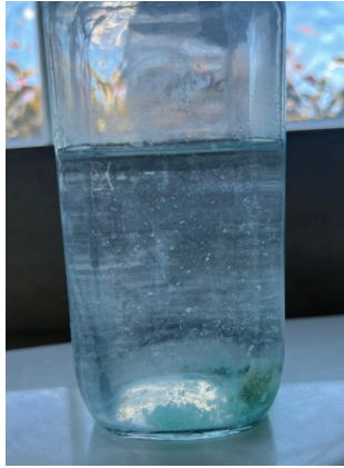
Figure 4: S. major and D. magna growth after copper sulfate ( \text{CuSO}_4 ) treatment. Forty-eight hours after the introduction of copper sulfate, S. major was dyed blue with chlorophyll barely visible and sunk to the bottom. D. magna also sank to the bottom of the jar and experienced 100% mortality (n = 4).

S. major , D. magna + food, and \text{H}_2\text{O}_2 as the algaecide, and Jar 6 contained S. major , D. magna + food, and bentonite clay as the algaecide (Table 1).