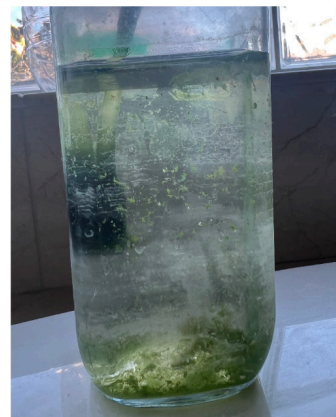
Figure 2: S. major and D. magna growth after bentonite clay treatment. The image shows 48 hours after addition of bentonite clay treatment. S. major and D. magna sunk to the bottom, weighed down by the clay. D. magna experienced 75% mortality (n = 4).

algaecides on the S. major and D. magna on a microscopic level. In the control jar, S. major was thriving, and the chlorophyll was visible and pigmented (Figure 5A). Samples viewed from the jars containing the bentonite clay, hydrogen peroxide, and copper sulfate all presented negative effects as the algal cells were clumped together, bleached, and discolored (Figure 5B, Figure 5C, Figure 5D).