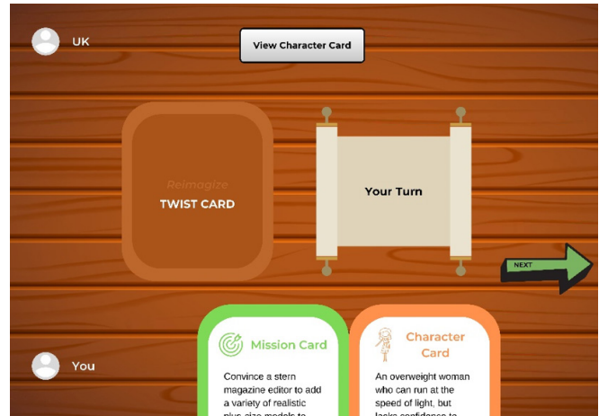
Figure 1: Game Screen – An image of one of the screen prototypes of the game. The mission card reads, “convince a stern magazine editor to add a variety of realistic plus-size models to their new beachwear advertising campaign”, and the character card reads “an overweight woman who can run at the speed of light, but lacks confidence to speak or perform in public.”

The body esteem scores increased after the experiment, which provides evidence to suggest that the game had a positive impact on the personal body-esteem of adolescent