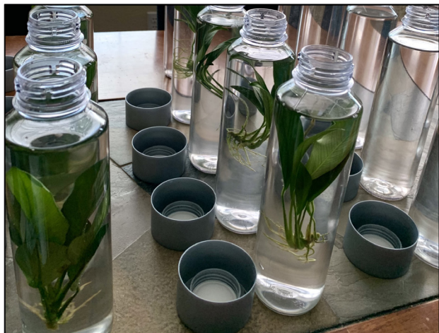
Figure 3. Experimental setup. Experimental containers with freshwater creek samples and preselected treatment ( A. b. var. nana , A. b. var. congensis , and no plant) prior to dry ice exposure.

in the containers and remained floating throughout the experiment (Figure 3). The temperature of the water was recorded to ensure the water temperature was optimal for the aquatic plants selected. Using the pH meter, each water sample's pH was recorded.