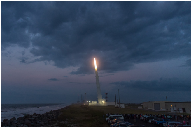
Figure 1: Cubes In Space™ Rocket Launch (12). A view of the rocket launch used for the Cubes In Space™ Program.

ionizing and UV-C radiation experienced during rocket launch and spaceflight will negatively affect the cellular functions of the E. coli bacteria and kill some bacterial cells, but will not exterminate the entire culture of bacteria. Results from this experiment will help scientists better develop antimicrobial measures to sterilize spacecraft before launch and characterize how bacteria respond to the space environment.