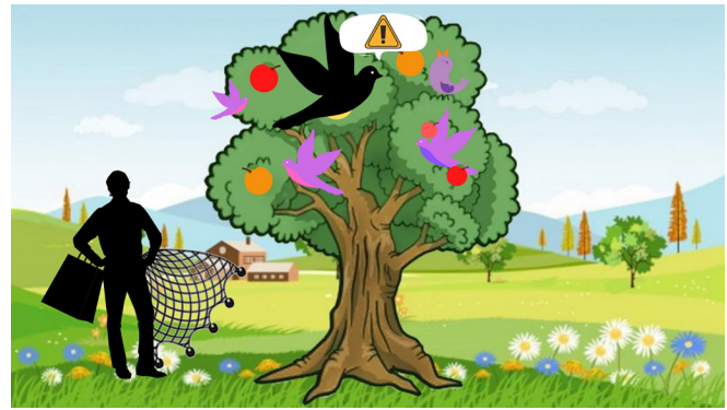
Figure 1. Sample game scene from the Autest app. The app utilizes bright colors and animations accompanied by music to generate an interactive audiovisual experience for the test-taker.

has to complete interactive tasks to pass levels and proceed through the game. As the child is engaged throughout the process and is not interviewed by someone they have not known beforehand, social inhibition is reduced, and testing is more reliable. The use of pictures, animations, emojis, and music removes a language barrier and thus, Autest can ideally be administered in most parts of India. A sample game scene ( Figure 1 ) has been provided in this paper.