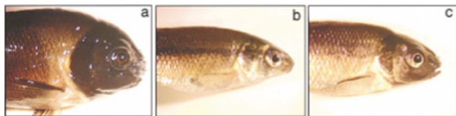
Figure 1. Occurrence of nuptial tubercles in fathead minnows exposed to \beta -trenbolone. (a) Control male, (b) control female, and (c) female. Image from (5). The photos demonstrate that exposure to anabolic-androgenic steroids can result in important physical and physiological changes in aquatic life that warrant further investigation of how these chemicals diffuse through soil.

into the soil plot, with gravitational forces creating vertical diffusion greater than the horizontal diffusion caused by water flow through the soil. To investigate our hypotheses, we added diluted luminol to soil plots and inspected for the presence of luminol below the surface. In separate experiments, we examined soil core samples and soil layers.